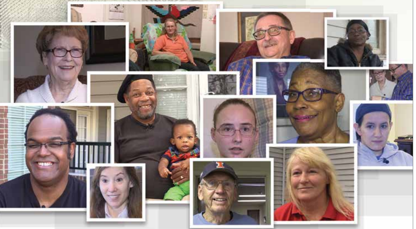
All persons shown are actual beneficiaries