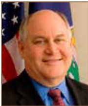
LEGISLATIVE COMMITTEE CHAIR Ron Estes State Treasurer Kansas