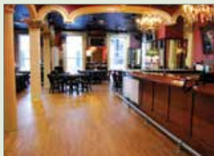
Acme Oyster House

DINE-AROUND IN THE FRENCH QUARTER Restaurant options include: