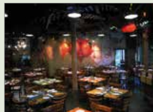
Red Fish Grill

Menus and information about each restaurant will be available at the registration desk. YOU WILL RECEIVE A TICKET FOR THE RESTAURANT OF YOUR CHOICE, AND YOU MUST HAVE THE TICKET TO ENTER THE RESTAURANT FOR DINNER. Seating is limited at each restaurant, so be sure to sign up early for the best chance of receiving your first choice!