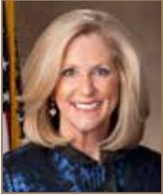
SOUTHERN REGION VICE PRESIDENT Lynn Fitch State Treasurer Mississippi