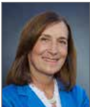
EASTERN REGION VICE PRESIDENT Deborah Goldberg State Treasurer Massachusetts