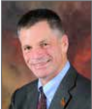
SECRETARY-TREASURER Mark Gordon State Treasurer Wyoming