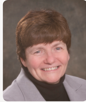
HON. BETH PEARCE Treasurer, State of Vermont