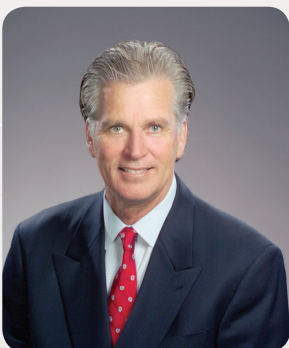
HON. ANDY DILLON