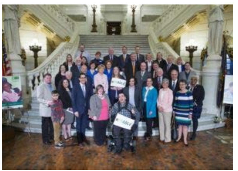
Pennsylvania April 2017